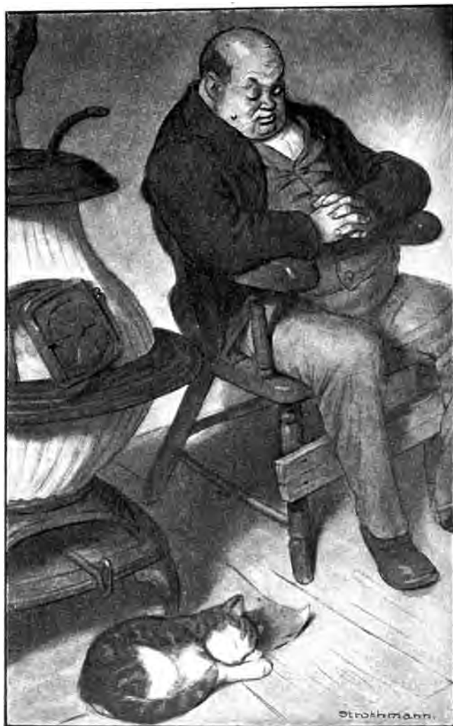
"I FOUND SIMON WHEELER DOZING COMFORTABLY"